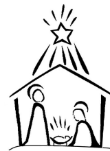
Tableau / Readings

This is short service of carols, readings and a tableau, prepared and delivered for and by our children. Please come and support and encourage your child/children to get involved.